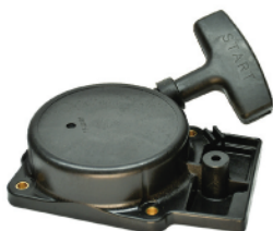
RECOIL STARTER FOR REDMAX

REPLACES MTD 742-05510-X FITS MODELS CUB CATE XT2 PS 117, XT2 QS, XZ6 S117