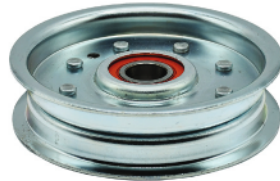
IDLER PULLEY FOR JOHN DEERE

REPLACES JOHN DEERE AM134500 FITS SEVERAL JOHN DEERE X500, Z400, AND Z600 SERIES