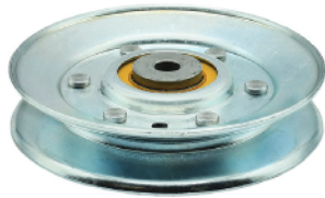
IDLER PULLEY FOR JOHN DEERE