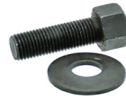
BOLT & WASHER KIT FOR TORO

REPLACES MTD / CUB CADET O.E. PART NUMBER 02003622 FITS ENFORCER 44, 48 AND 54. ALSO FITS Z-FORCE 44, 48, 50, 54 AND 60