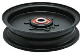
FLAT IDLER PULLEY FOR JOHN DEERE

REPLACES JOHN DEERE TCA17540 FITS SEVERAL JOHN DEERE MODELS INCLUDING X300 SERIES AND 737, 757, 797 ZERO TURNS