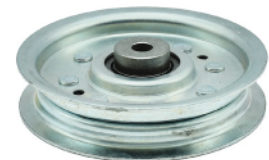
IDLER PULLEY FOR JOHN DEERE

REPLACES JOHN DEERE AM128118 FITS SEVERAL JOHN DEERE MODELS INCLUDING Z200, Z300, Z400, AND Z600 ZERO TURNS