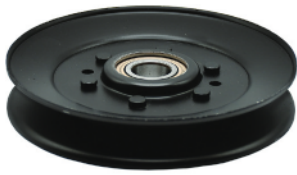
IDLER PULLEY FOR JOHN DEERE

REPLACES JOHN DEERE AM143737 FITS SEVERAL JOHN DEERE MODELS INCLUDING Z200 AND Z400 SERIES