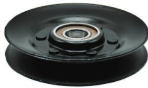
IDLER PULLEY FOR JOHN DEERE

REPLACES JOHN DEERE AM135957 FITS SEVERAL JOHN DEERE X300 SERIES