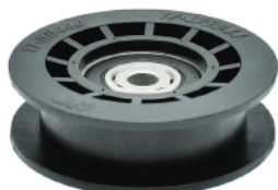
FLAT IDLER PULLEY FOR HUSQVARNA

REPLACES JOHN DEERE AM115933 FITS SEVERAL JOHN DEERE MODELS INCLUDING COMMERCIAL WALK BEHINDS, 717 AND 727 ZERO TURNS