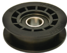
FLAT IDLER PULLEY FOR HUSQVARNA

REPLACES TORO 3290-465, 26-0671 FITS 30" TIMEMASTER, RECYCLER RIDER, REAR ENGINE RIDER AND CAREFREE RECYCLER