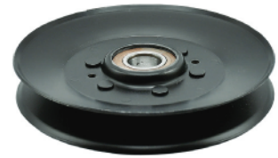
IDLER PULLEY FOR JOHN DEERE

REPLACES JOHN DEERE TCA17541 FITS SEVERAL JOHN DEERE MODELS INCLUDING X300 SERIES AND 737, 757, AND 797 ZERO TURNS