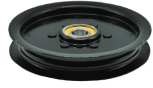
IDLER PULLEY FOR JOHN DEERE

REPLACES JOHN DEERE TCA17146 FITS SEVERAL JOHN DEERE MODELS INCLUDING X300, X500, Z500, AND Z800 SERIES